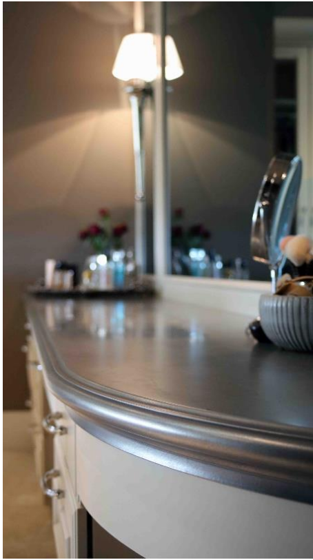
Pictured is Argentum